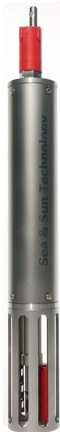
Figure: CTD48M probe equipped with C, T, D, and oxygen sensors

L (housing).approx. 215 mm Ø (housing)..... 48 mm L (overall)...approx. 400 mm W (in air).....approx. 1,2 kg